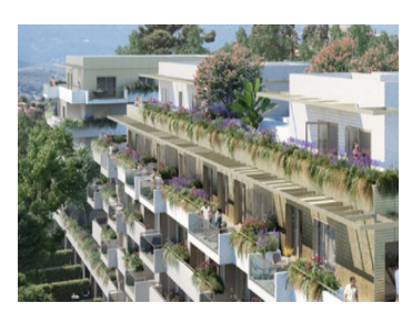
ENERGY - DPE