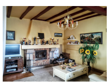
FNFRGY - DPF