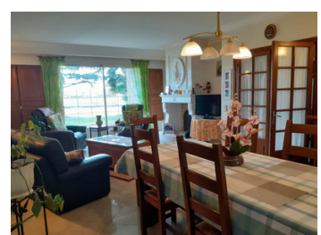
FNFRGY - DPF