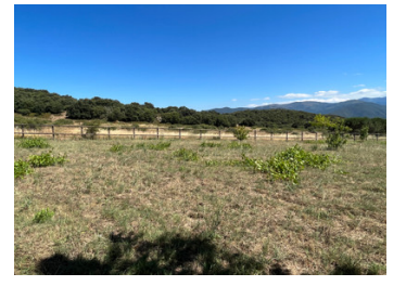
ENERGY - DPE