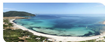
LA PLAGE DE CAPO DI FENO